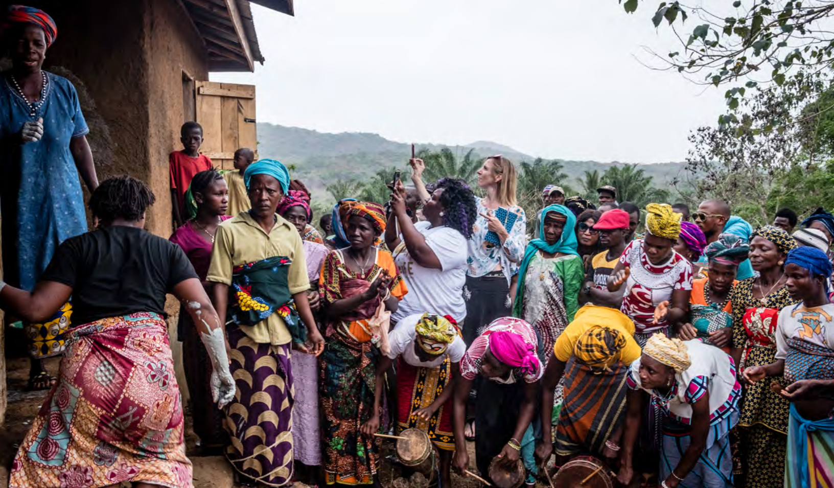
Constellating Peace delegates visit the Madina Community Health Post, in Kasunko Chiefdom in Koinadugu District. Community members raised the needed funds and helped build the post.

The transformative power of putting the wisdom, dignity, and capacity of local communities at the center—of the peacebuilding work and of the Constellating Peace cohort—was not limited to visitors to Sierra Leone. One of the Peace Mothers attending the program wrote that meeting participants from troubled places around the world showed her how far Sierra Leone has come. “My country is more peaceful than other countries,” she wrote in a reflection. Another wrote, “Sierra Leone people can do things that can be admired by other nationals, to the point they will want to replicate it in their own countries.”