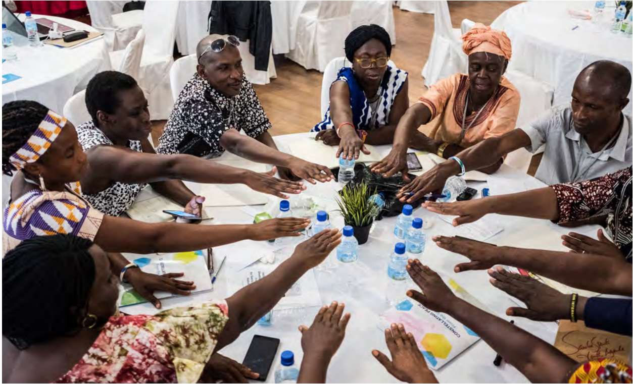
Delegates engage in creative conversation about inside-out peacebuilding in their own contexts.

of Sierra Leone, which only two months before had formally launched its new National Development Plan, incorporating the core elements of Fambul Tok’s People’s Planning Process (PPP) as the foundation for people-centered national planning. This is part of the Government’s implementation of the Wan Fambul National Framework for Inclusive Governance and Local Development , which represents a commitment to fully scale the PPP, after it was successfully piloted in three districts across the country. The PPP allows villages to articulate their priorities and visions, and the Wan Fambul National Framework makes those priorities the drivers of national development for the first time in the country’s history. “The Wan Fambul National Framework in my view and in the view of the government is a unique experience of government policy designed to put people at the heart of development,” said Prof. David J. Francis, chief minister of Sierra Leone. “This framework ensures that our country’s development is led and owned by the people.”